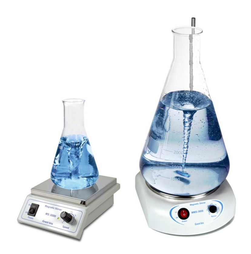
High speed magnetic stirrers MS-3000, MMS-3000