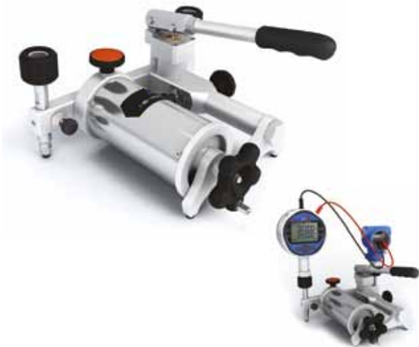
-14 psi to 60 psi