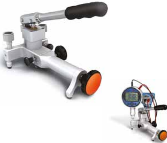
-14 psi to 375 psi