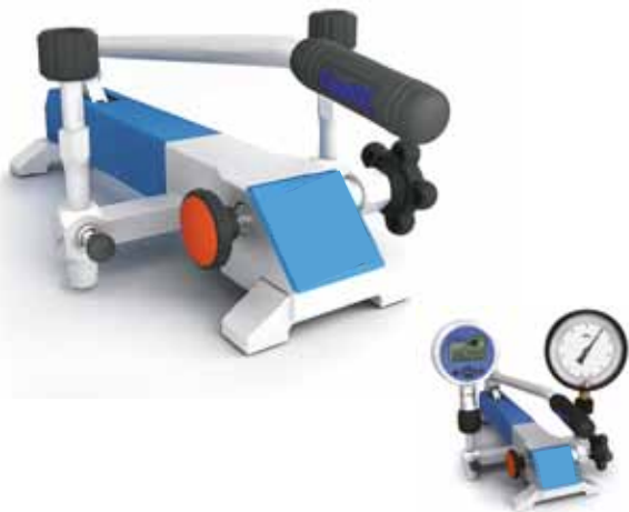
-14 psi to 2,000 psi